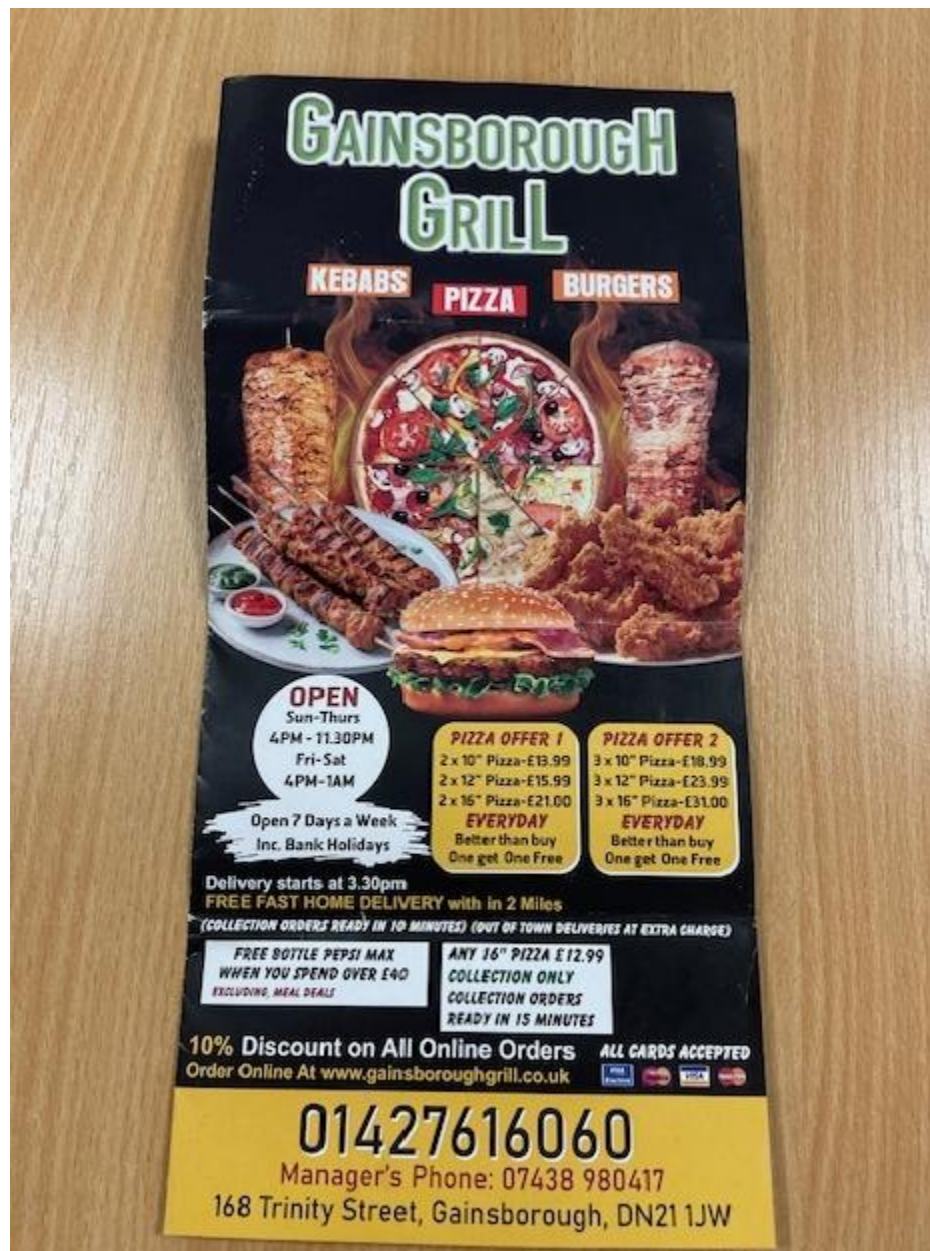
KJE3- Menu leaflet from January 2025.